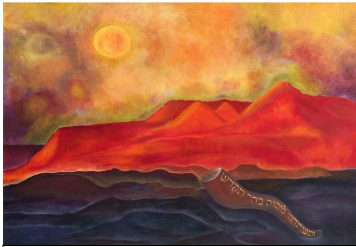
Depiction of Isaiah’s Holy Mountain from sicutlocusest

But, if you are in that first happy group of believers, the ones who are glory bound, how do people around you know that? What are some of the items of Spiritual clothing with which a believer dresses himself? What are the values of the true believer by which she is easily recognized even in this world?