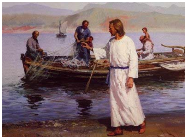
Depiction of Mt.4:19 and Mk.1:17 from www.livingspark.com

Of course, there is dread just prior to this leap into the void of space for the baby bird. But once it has launched itself into the air, more often than not for the fledgling, the ability to fly is instantaneous. Maybe there are a few short legs of the journey into freedom to begin with, a few connecting flights from the nest to a low hanging branch or a patch of grass. The novice cyclist falls a few times, to be sure, maybe even skins his knees from time to time. But, soon the baby bird finds that the air is his natural element, and he's off soaring into space, rising like the notes of a victorious melody into the glorious sunlight. Because, you see, a bird was made to fly. Soaring into freedom is what he was meant to do. The freedom of the heavens is his natural element.